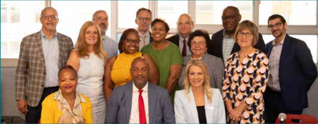
Members of the CEC at the August kickoff meeting. Note: not all members of the committee are shown.